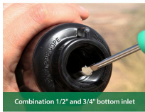
Combination 1/2" and 3/4" bottom inlet