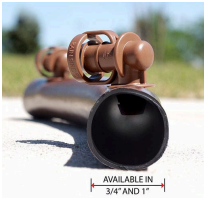
AVAILABLE IN 3/4" AND 1"